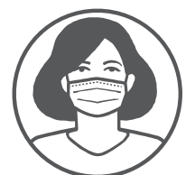
Wear a mask on all public transport if you are able