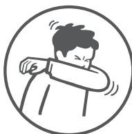
Cover coughs and sneezes