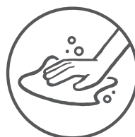
Wipe down all commonly used surfaces