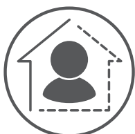
Stay home if you are sick

While we have been fortunate in Aotearoa, the risk is still there and we need to do everything we can to combat it. History has shown us that Māori are particularly vulnerable to severe health impacts from COVID-19, and the way we live and work means we may also be more likely to contract it if there is an outbreak.